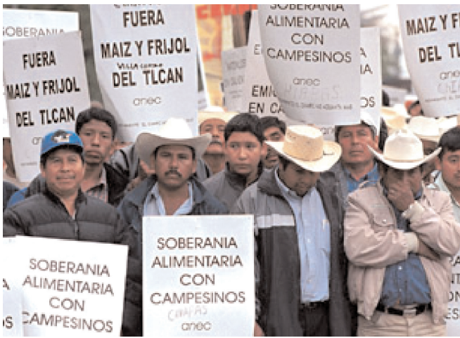
“Maize and beans out of NAFTA – food sovereignty for peasants”