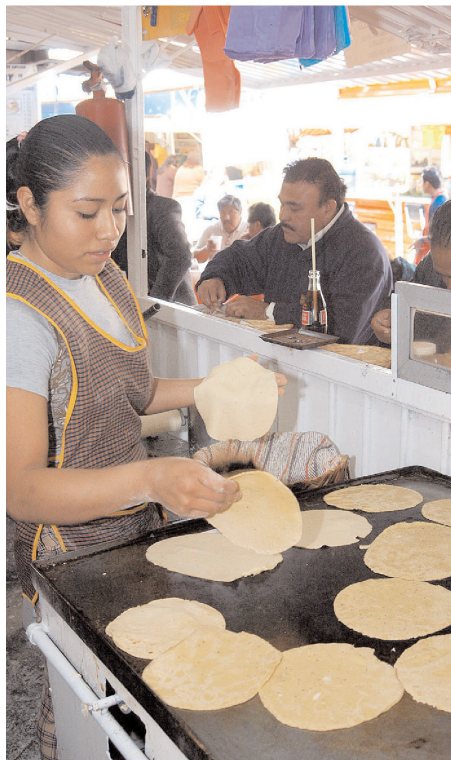
The price of tortillas has been going up dramatically in Mexico not because of a lack of corn but because of the monopolistic structure of the industry that NAFTA has driven. (Photo: National Autonomous University of Mexico, January 2007)

could not feed corn to livestock, as it was regarded as a staple food for the population, but this ban was lifted in 1996, and the livestock sector became the main destination for imported corn. Grain consumers 21 gained political power needed to influence agricultural and trade policy: they avoided paying the tariffs permitted under NAFTA for corn imports above the quota. The Mexican government effectively practised dumping against its own national corn producers by eliminating the tariffs designed to protect their production. Small farmers were forced to bear a huge burden in order to benefit importers, among them some of the world's largest TNCs.