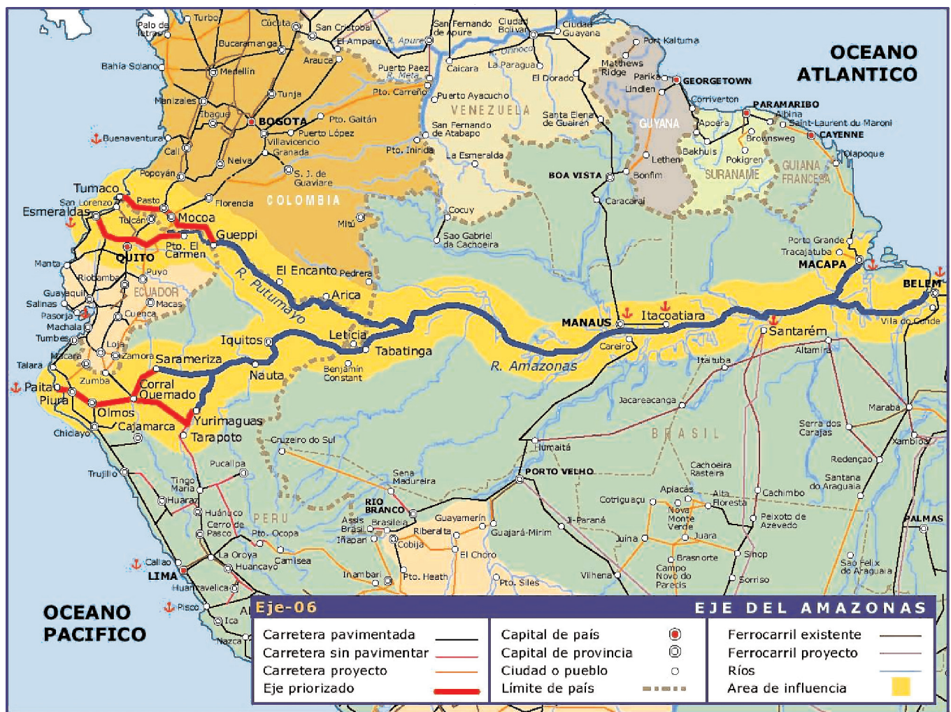
Regional integration initiatives, like IIRSA, can mean more social and environmental upheaval.

Perhaps this is why the differences between Chávez and Lula shifted from diplomacy to public statements. The Venezuelan President said that he is not interested in the “old” Mercosur. The divergence between the two countries is getting wider each day. Brazil is out to do business, and positions itself as a regional and global power, but it does not make the slightest gesture towards regional integration and, above all, is not willing to make any sacrifice to bring it about. Meanwhile, Venezuela continues to take initiatives and push business ventures directly towards strengthening regional alliances.