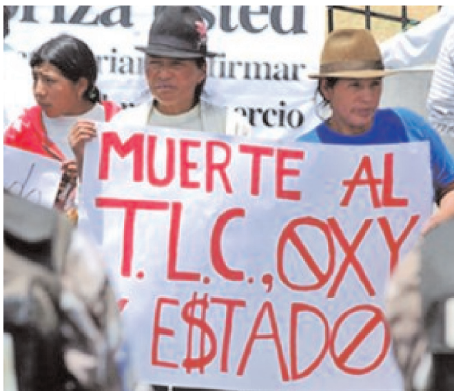
Indigenous peoples protest in Ecuador: "Death to the FTA, OXY and the State"

Petrobrás, even though it is not a state enterprise but a mixed corporation.