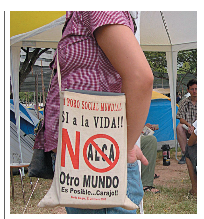
"Yes to life! No to the Free Trade Area of the Americas!"

nagging problem this raises, however, is the relationship between states and people. Today, rhetoric aside, hardly any state is not penetrated by neoliberal values.