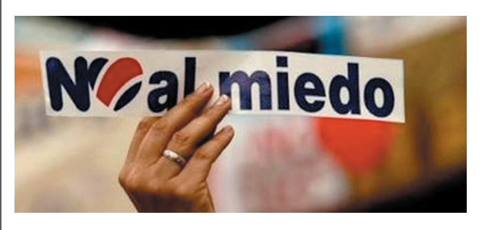
"No fear" to say no to FTAs. And, more importantly, "no to the intimidation" created by powers that push these deals. A message from the struggle in Costa Rica. (Photo taken just before the October 2007 referendum.)

4) Grounding in local struggles: FTA struggles highlight the importance of resistance firmly grounded in local and national contexts, but which connects to regional and global perspectives. The framing of FTAs as bilateral, regional or sub-regional, not to mention the plethora of different names for them (e.g. EPAs or CEPAs), can divert attention from the bigger picture, whether in the context of North-South or South-South deals. Strategies that emerge from strong local organising are the ones most able to map the terrain of struggle, to identify key local and international players push-