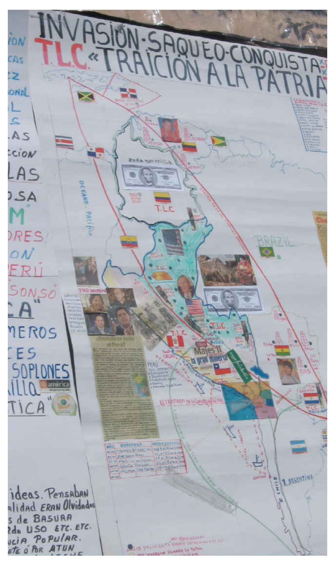
Mapping terrains of FTA struggle

FTAs and investment treaties are not merely trade pacts, but structural tools of overall "regime change" that aim to consolidate a very deep basis for new power relations in their countries. Those relations are not just economic ones, reshaping rules so that TNCs can do whatever they want, wherever they want. They are also geopolitical, pulling countries into much larger struggles for leverage and influence between states, be they old or emerging hegemons.