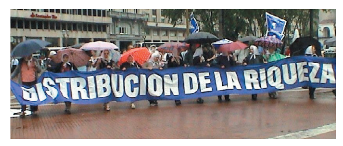
"Distribution of wealth now!" The Mothers of the Plaza de Mayo, an association of Argentine mothers whose children "disappeared" under the military dictatorship between 1976 and 1983, remind us constantly that our struggles must come together.

benefit to Chinese garlic producers. It was the middlemen, the traders, who were making all the money. We have to share experiences, learn from each other in much deeper ways and build common fronts of action. The same is true at the global level. Latin America has had the misfortune of being the vanguard of the struggle against FTAs because of US aggressiveness towards what it considers its backyard. Many people in other parts of the world have learned a lot from Latin American movements and are eager to learn more from them. We need to intensify this reaching out and learning - from the grassroots, not from the elites - to strengthen the fight. Much has been shared in terms of stories and analysis, understanding impacts and situations. But not enough yet in actually working and fighting together, whether across the Thailand-China border or as people of Peru and Senegal in common struggle.