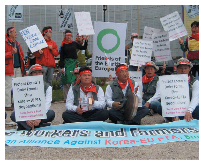
European and Korean activists join forces in the struggle against the EU-Korea FTA in Brussels on 17 September 2007

visions of the EU's FTAs, which are very open and vague, and subject to "interpretation" every three or five years. This is another reason why the struggle against these agreements must continue.