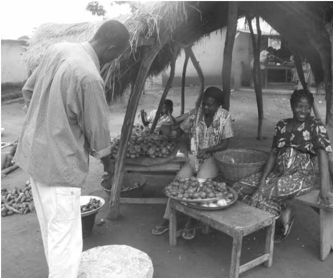
Cosmas Ochieng/ActionAid UK