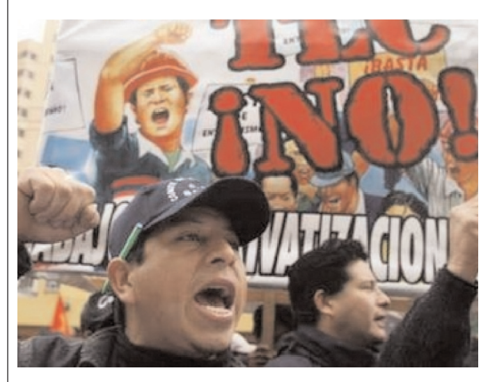
Colombia's horrific record on labour and human rights has been a major sticking point with the US political elite, which has to approve the deal.

The FTA has not yet been ratified by the United States Congress. So far, they have only ratified the FTA with Peru, in both the House of Representatives and in the Senate. In the case of Colombia, the deal is held up by opposition from the Democratic Party, now the majority in both chambers, given the denunciations pouring in from both the national and the international community against the government of Alvaro Uribe, whose close relationship with paramilitary groups and drug traffickers has contributed to the escalation of violence, especially in rural areas of Colombia. There is a kind of lull in the adoption of this FTA. The main candidate of the Democratic Party for the US presidency, Hillary Clinton, said she is against the FTA with Colombia. It is unlikely now to be approved by the US Congress in 2007. The year 2008 might not be conducive to its passage either, since the US will be in an electoral process and broad sectors of US public opinion are highly