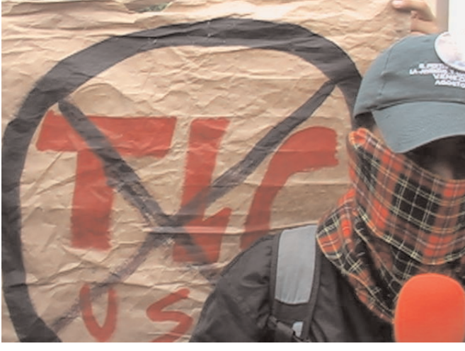
FTA protester in Colombia

This interview was conducted by Silvana Buján for Fighting FTAs in November 2007